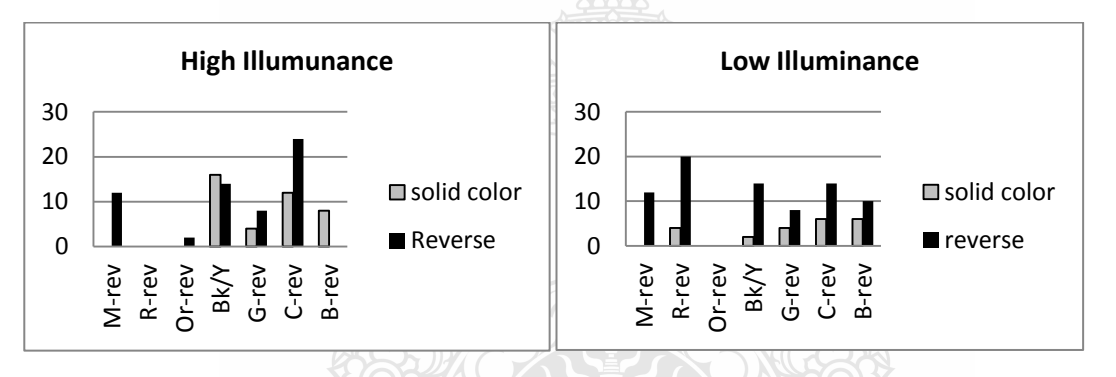
Figure 3 Comparison of solid color and reverse color styles.

The color graphic sign with white figure in cyan background appears the most distinguished to the elderly in the open area. But in lower illuminance, inside the building the white figure in red background is the most distinguished one. The graphic sign with more color area, reverse color sign is easier to see than the solid color in white background. This can be explained that the white background might have glare in bright surrounding, which causes desaturate color of the figure. This effect much more pronounces for the elderly with cataract eyes[4], [5], [6].