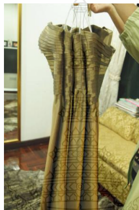
Figure5. Finished evening dress