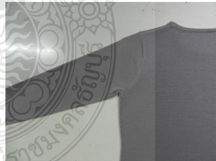
Figure 9: Iron and Knitwear surface distance Figure 10: Seam must be ironed 1 cm to back