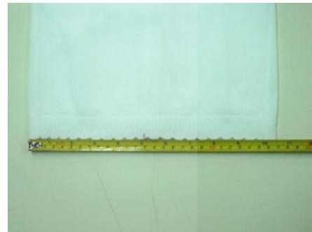
Figure 4 : Hem width