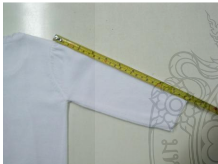
Figure 5 : Sleeve length