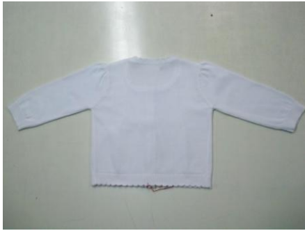
Figure 1: Prepare of sample to measure