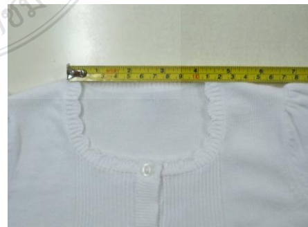
Figure 8 : Neck width