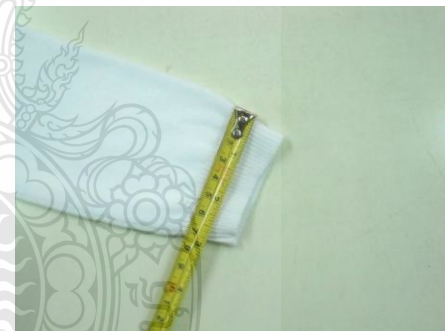
Figure 6 : Sleeve hem width