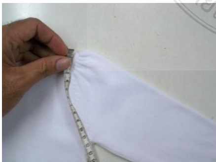
Figure 7 : Armhole width