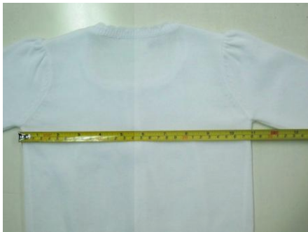
Figure 3 : Chest width