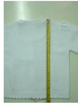
Figure 2 : Back length